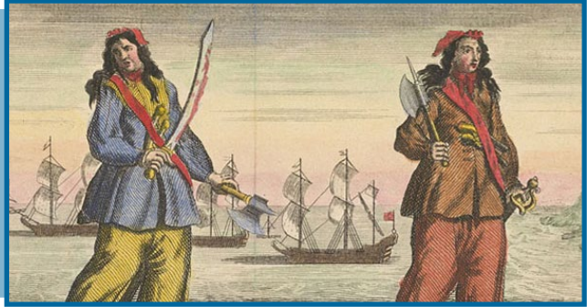
Anne Bonny and Mary Read

Although most pirates were men, some were women. Mary Read and Anne Bonny were the most famous women pirates. They worked together to capture ships until they were caught in 1720.